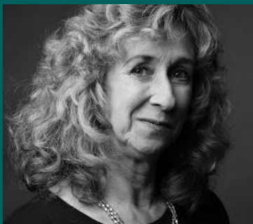
Sy Montgomery, Author