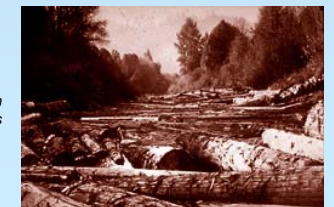
Historic splash dam effects