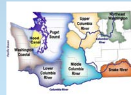
Salmon Recovery Regions